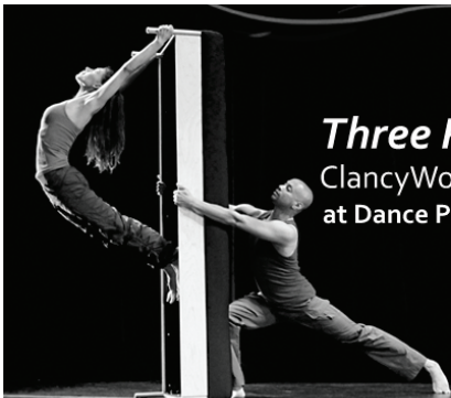
Pictured: ClancyWorks Dance Company.

For more information: www.clancyworks.org | bookings@clancyworks.org | 301-717-9271